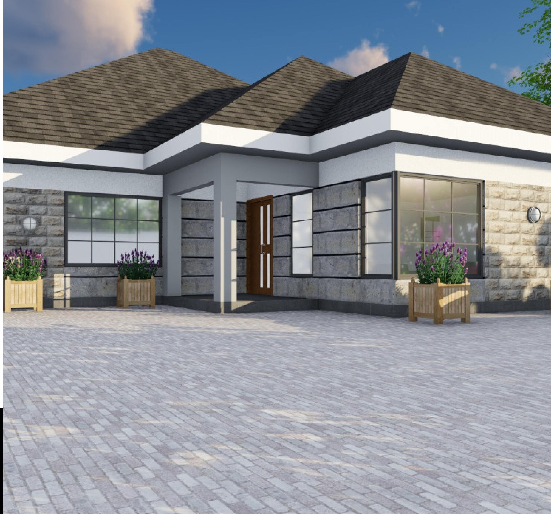
4 BEDROOM DUNGALOW DESIGN