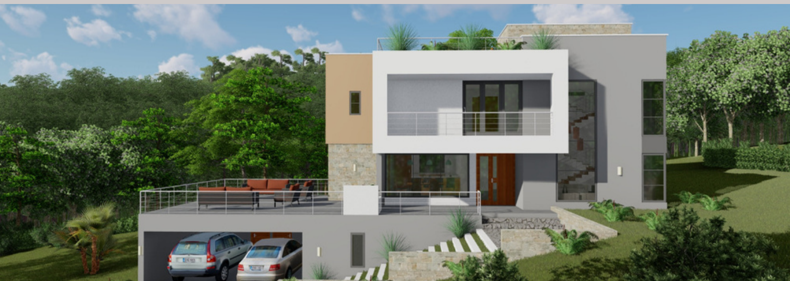
KITISURU VILLA A MODERN AESTHETIC